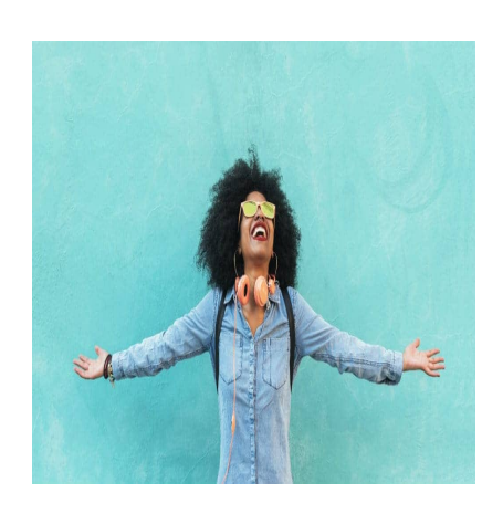
2 Industries Millennials Should Focus On