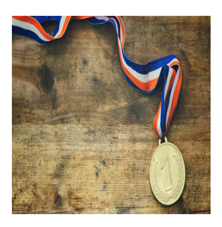
This Top TSX Financial Stock Can Make You Rich