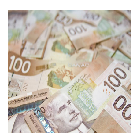
3 Top TSX Stocks to Buy Today With $3,000