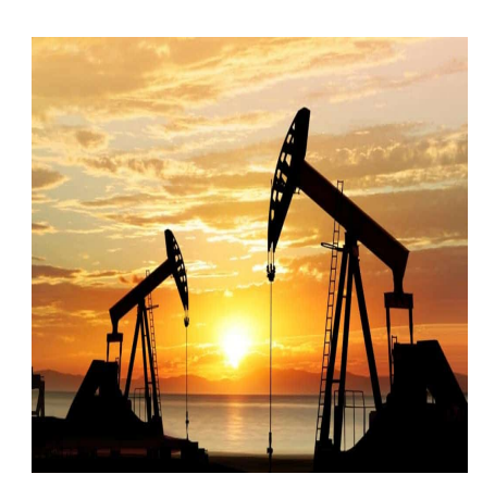
3 Top Energy Stocks to Buy in July